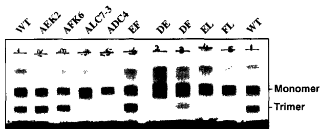
Fig. 2. Trimers of PSI cannot be obtained in PsaL-less mutants. Trimers and monomers from the membranes of different mutant strains (Table I) were resolved on sucrose-density gradients as described in Fig. 1.